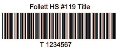
Sample 7-digit Follett Classic Title Barcode

8 characters or more (14 max) that contains the Type Indicator, Location Code, Item Number and a Check Digit.